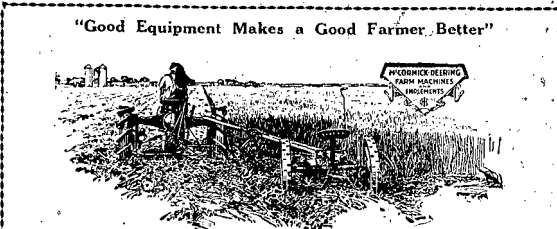
"Good Equipment Makes a Good Farmer Better"